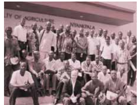
British Council/ACU DelPHE, Grant Writing Workshop, at the University for Development Studies in Tamale, Ghana, in January 2009

For further information, please visit http://www.britishcouncil.org/delphe.htm